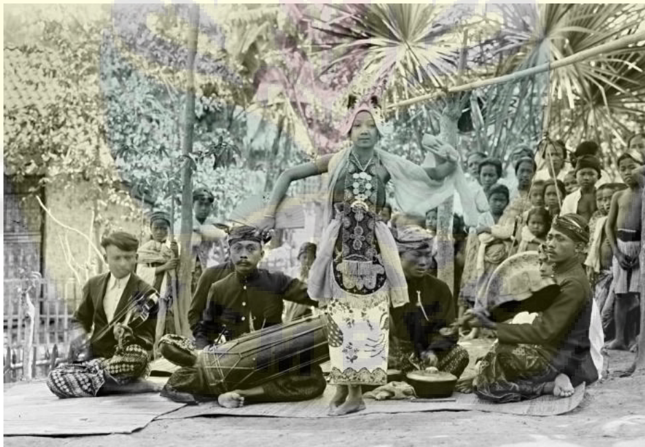
Figure 2. The folk song is sing for Gandrung art show

Geno gelis gaduk tujuan (so quickly reach the purpose of life)