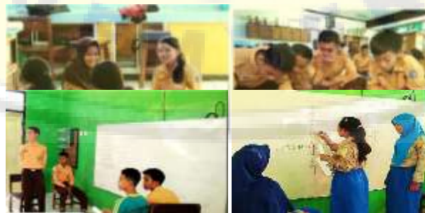
Figure 3:- students' activity in group discussion

Students' activity in group K2, students write down the known and asked at the stage of reviewing and presenting the problem. At the stage of strategizing, each member of the K2 group chooses a elimination-substitution method and tries to solve individually and then compare with each work result. The results obtained are same answer. When at the stage of implementing the strategy, one group member advises using another method of graphical methods. When the equation is made graph it turns out that the results obtained are different from previous results. Then each member of the group checks coordinate point passed by a straight line to ensure that the coordinate points along the straight line represent solution the linier equations system of two variable. After making sure of the test point, the K2 group makes a conclusion. Students' activity during the learning process can be seen in figure 3.