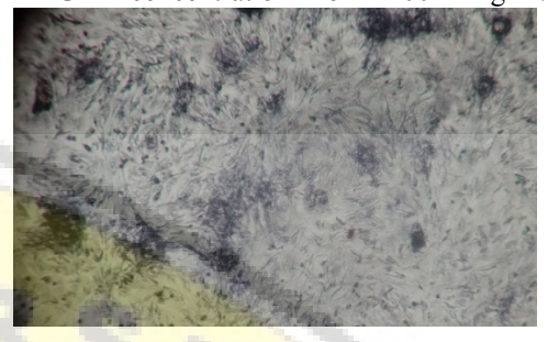
Figure 1: Viable cells after incubated with HAGP immersion medium at concentration of 10 mg / mL.

The viable rat's MSCs can be shown in Figure 1. HAGP concentration of 10 mg / mL, Figure 2. HAGP concentration of 50 mg / mL, Figure 3. HAGP concentration of 100 mg / mL.