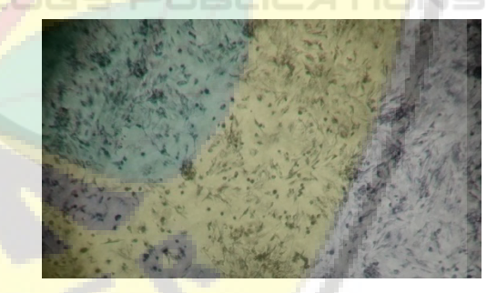
Figure 3: Viable cells after incubated with HAGP immersion medium at concentration of 100 mg/mL.

HAGP Scaffold cytotoxicity was examined using MTT method to obtained viable cells percentage (table 1).