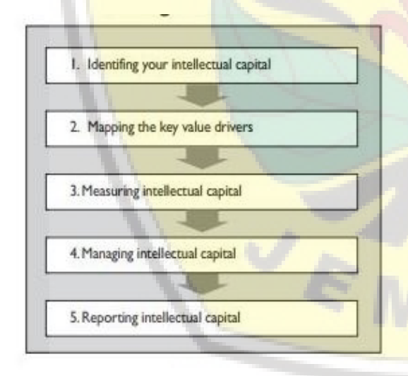
Figure 3: Intellectual capital management model