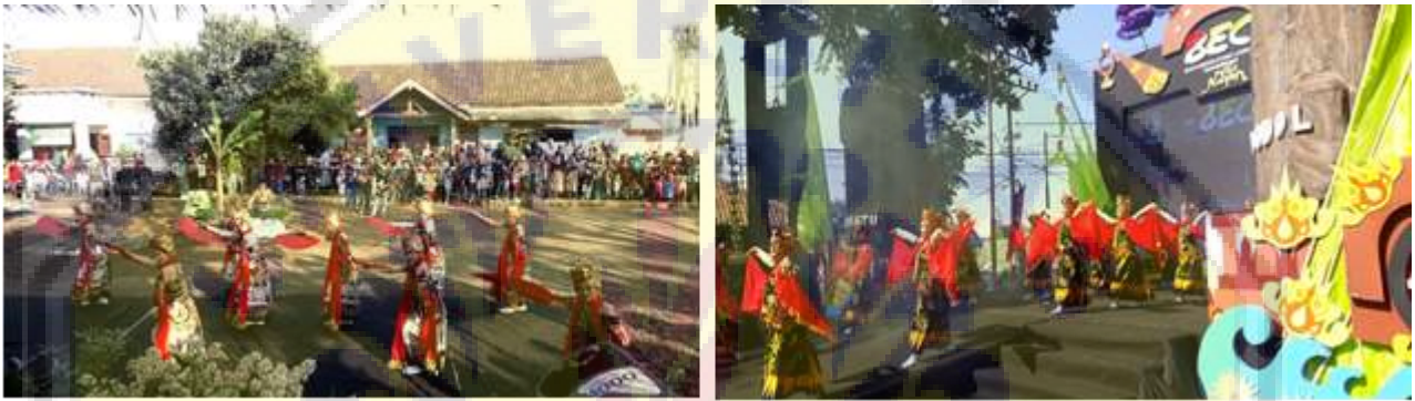
Figure 3. Dance “Jejer Gandrung” on Keboan Aliyan (Left). Dance “Jejer Gandrung” on BEC program (Right).