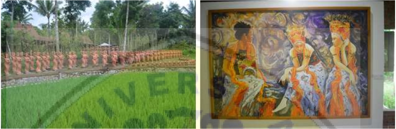
Figure 4. The Statue of Gandrung Tarakota (left) and one of the collections of Gandrung painting (right).