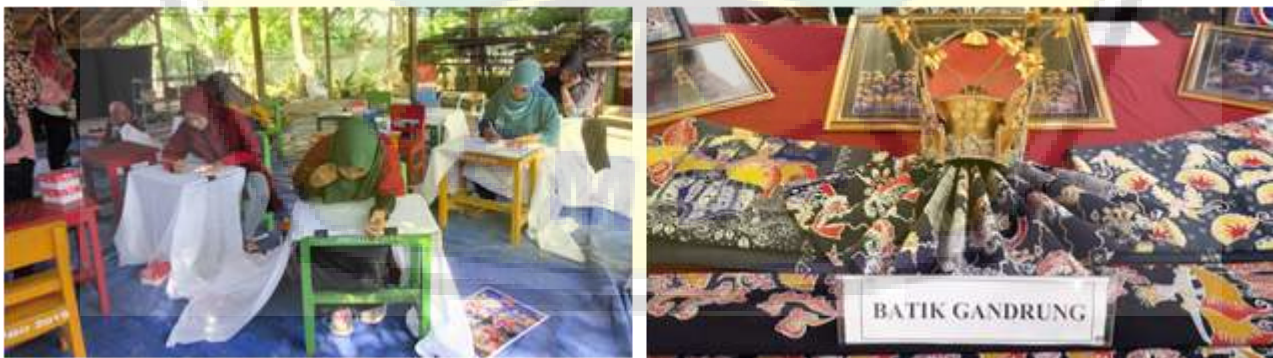
Figure 5. The participants of Batik Gandrung at Batik Godho (left). The result of the workshop is exhibited at Universitas Jember on July 31, 2019 (right).

Greatness and uniqueness of the artistic traditions as a source of inspiration in love making the process of creating various fields of art in Banyuwangi. Most of the art products are inspired by traditional art Gandrung contained in Taman Gandrung Terracotta. Location located at the slopes of Mount Ijen collecting Gandrung terracotta statues and paintings. While the literature that draws inspiration from Gandrung written by Hasnan Singodimayan entitled Kerudung Santet Gandrung , The novel as a form of defence against the perpetrators of traditional art Gandrung that they are stigmatized as "immoral". The novel was never a concern of national television station Televisi Pendidikan Indonesia (TPI), which ran a story trail Sinden made based on the novel by Singodimayan.