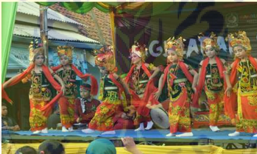
Figure 2. Students from Sanggar Sayu Gringsing perform dance “Jejer Gandrung” (Research Documentation)

The government's policy to develop traditional arts Gandrung as a follow-up of the regulation is also implemented in the program's annual Gandrung Sewu festival . The word Sewu 'Thousand' in construction Gandrung Gandrung Sewu , now a name that does not indicate the amount. Festival participants tend to continue to exceed the sum of one thousand. Gandrung Sewu festival from year to year also experienced dynamics, from the original pure dance performances to lift the travel narrative ballet dance history gadrung , 2014. Further performances of the festival devoted a story and history of Gandrung Sewu Banyuwangi are struggling to fight against the foreign rulers. The struggle is embodied symbolically in a series of lyric song commonly sung to accompany the dance like “Podho Nonton”, “Seblang Subuh”, “Seblang Lukinto”, “Kembang Pepe”, dan “Layar Kumendhung” (Anoeграjekti, et al., 2018:66-67) is loaded with a message of struggle of Banyuwangi.