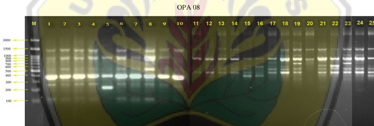
Fig 1. DNA ribbon profile of 10 black rice cultivars (1-10) and 15 aromatic rice cultivars (11-15) using RAPD OPA 08 primers with a 100-bp DNA marker size.