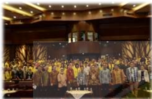
The Southeast Asian Studies Symposium