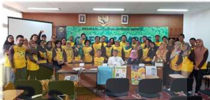
Green Campus School of Environmental Science UI 2018

During this time the activities of the University of Indonesia in the environmental field were carried out based on the agreement between the State Minister for the Environment of the Republic of Indonesia and the Chancellor of the University of Indonesia signed on June 7, 1980. Because of the need for experts in the environmental field who increasingly demanded scientific handling, then in the 1982 academic year / 83 Universitas Indonesia held a Postgraduate Program in Environmental Sciences with enthusiasm in the field of Human Ecology which was inaugurated by the Chancellor of UI Prof. Dr. Nugroho Notosusanto on August 25, 1982. This program was originally managed by the Faculty of Mathematics and Natural Sciences, University of Indonesia, then moved under the newly formed age at the beginning of 1983