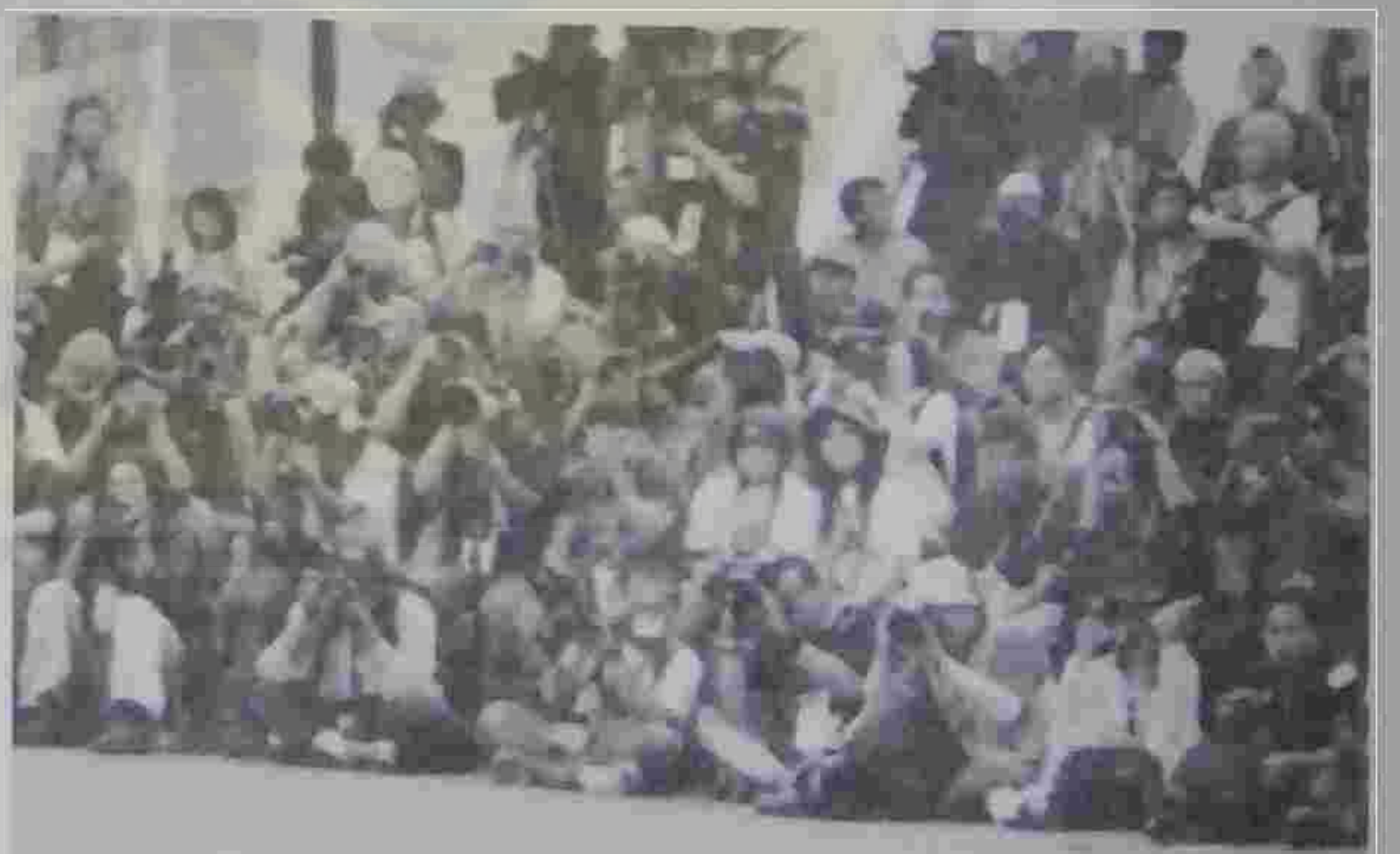
(Welcome to Jember JFC world fashion carnival, 2009); (photografers)