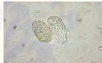
Figure 1b. Urediospora P. pachyrhizi