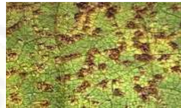
Figure 1a. Symptoms of soybean leaf rust

Based on the composition and the number of genes, 3 kind of (1) monogenie, resistant properties are controlled by a single gene dominant or recessive, (2) oligogenik, resistant trait is controlled by several genes which reinforce each other, and (3) polygenic, resistant trait controlled by many genes that each add and each gene react differently to the races or strains of pathogens that result in the emergence of a broad resistance. Genetic resistance is also divided into two types (1) resistance of the vertical, resistance against just one biotype disease, and usually are very resistant, but easily broken by the emergence of new biotypes, (2) resistance of horizontal or general resistance, resistance to many biotypes of diseases with a degree of resilience moderately resistant (Triharso, 1996).