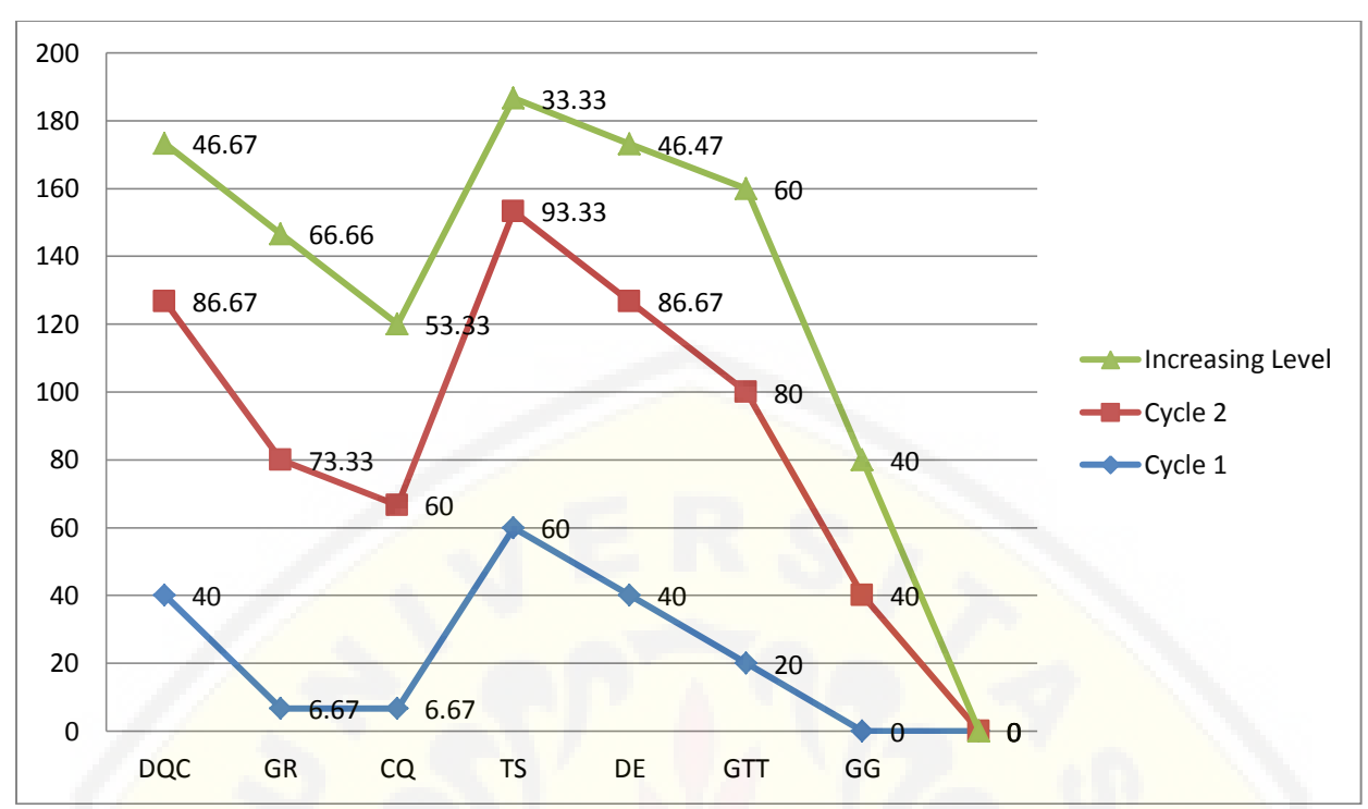
Diagram 3:- The Comparison of Each Basic Questioning Skill Component Performed in Microteaching Practice in cycle 1 and in cycle 2

Based on the results of the data analysis shown on table 5 and on diagram 3, it was found that the highest increase in the application of the basic questioning skill component in cycle 2 was on the component of giving time to think, that was 60%; while the lowest increase was on redirecting component, that was 33.33%. However, this component, redirecting component, had the highhest rank,ie 93.33% in cycle 2. This happened, because this component showed a high enough frequency of occurrence, ie 60%, in cycle 1. Thus, although in cycle 2 redirecting only showed an increase of 33.33%, the overall effectiveness level was still high compared with the other components.