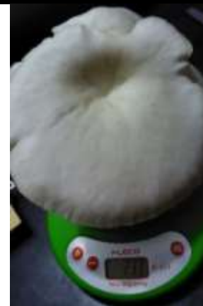
Fig.2: Process of Weighing Oyster Mushroom Wet weight

The process of measuring the wet weight of oyster mushroom when the harvest time arrive. The oyster mushroom can harvest 2-3 days after the appearance of the oyster mushroom pin head. Harvesting oyster mushroom by removing all parts of the body of oyster mushrooms. After the harvesting process, wet oyster mushroom weighing should be done immediately to avoid the decrease in the water content in oyster mushrooms that can affect the wet weight of fresh oyster mushrooms. Measurement of wet weight of oyster mushrooms is done using a digital balance sheet. The results of wet oyster mushroom weight measurement can be seen in Table 2.