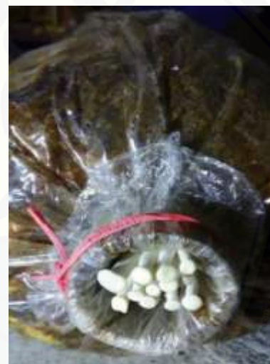
Fig.2: Oyster Mushroom Pin Heads

Early growth of oyster mushrooms is characterized by the appearance of white oyster mushroom pin head. The indicator of the appearance of pin head on oyster mushrooms seeds is marked by the appearance of white pins on the seed medium. Then there will be a process of deference to form the rod and hood. The appearance of the first oyster mushroom pin heads occurs after 57 days after the ELF field exposure. While the control class pin head appeared on day-to-58. The oyster mushroom pin head appears first in the experimental class given exposure to a 500 \mu T ELF magnetic field with 50 minutes exposure duration.