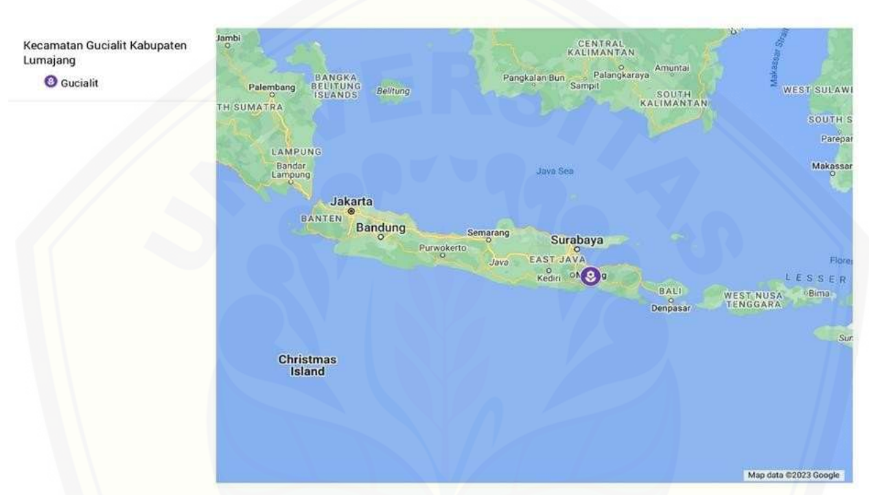
Figure 4. Map of Gucialit Village, Gucialit District, Lumajang Regency, East Java (Research Document)

Almost all coffee growers in the Java region sell their coffee in logs, therefore the selling price is inexpensive and does not reflect the processing procedure. This is due to the fact that farmers must meet the basics of existence. Because just a few farmers have significant expanses of well-processed land, the selling price is high. Farmers in Gucialit Lumajang District, including Gucialit Village, sell their coffee crop in the shape of logs (coffee beans that are still intact, not yet separated from the pulp) (KBBI). They demand quick results without considering the earnings and costs associated with the planting, caring, and harvesting processes. However, not all coffee producers sell their products in log form.