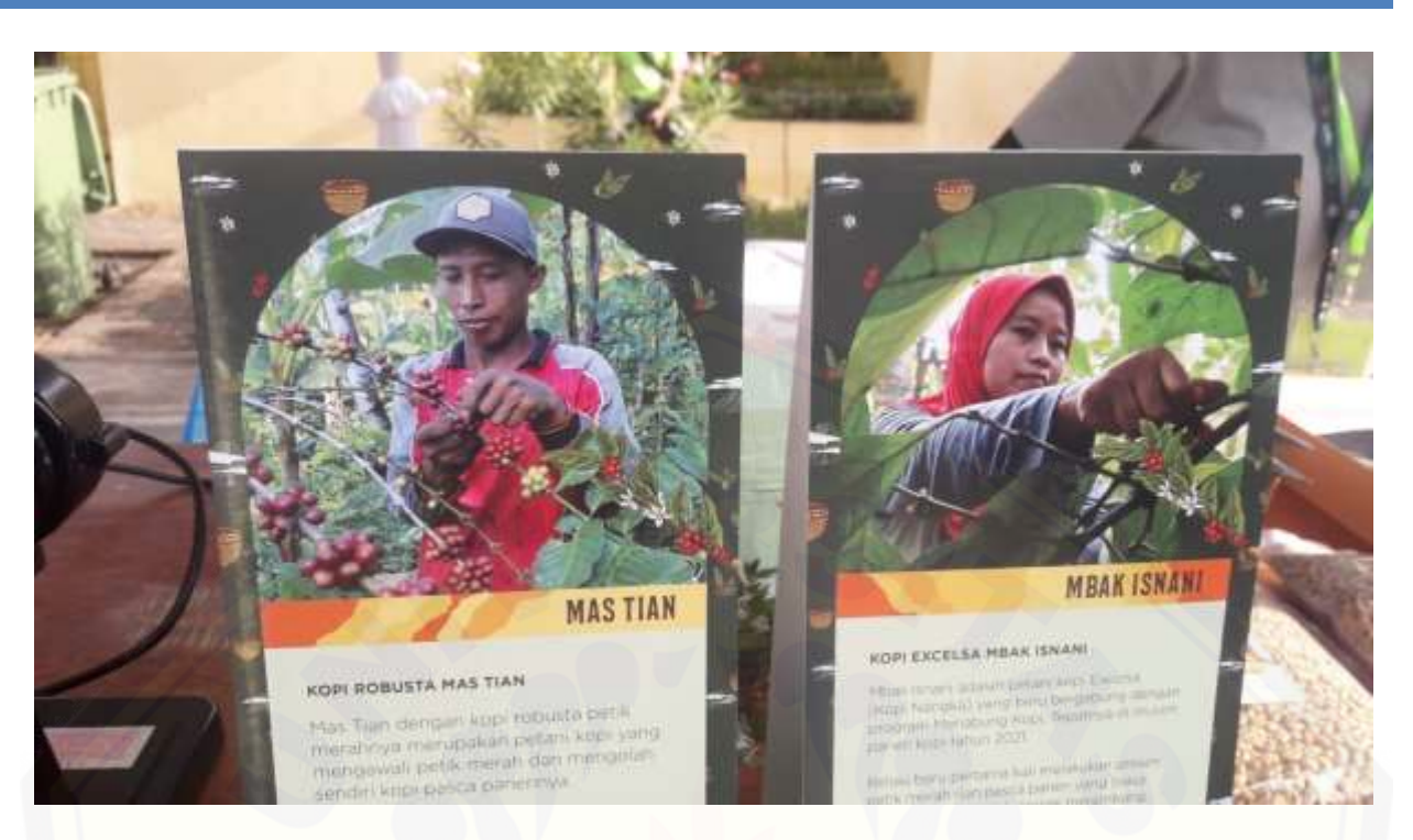
Figure 9. Promotion of Farmer's Coffee Products in "Menabung Kopi" (Research Document)