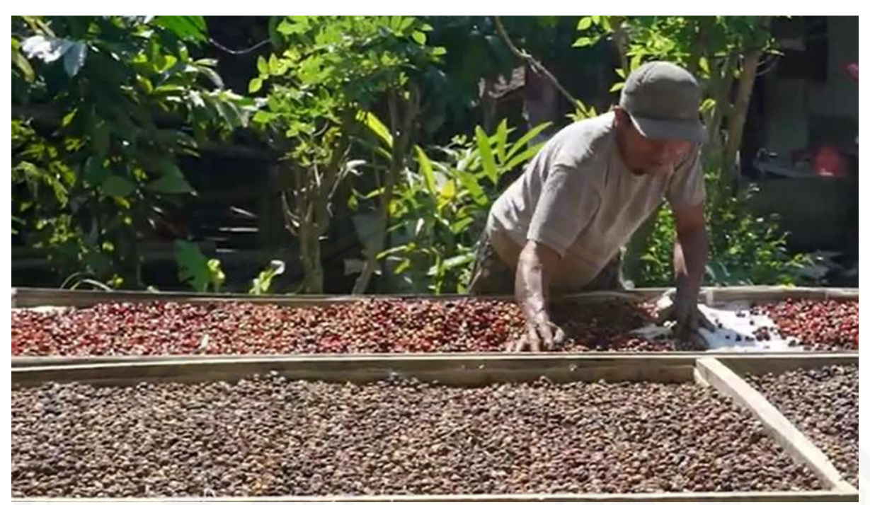
Figure 7. Drying Arabica Coffee on Para-Para (Document by Rifqi Zulkarnain Masruri)