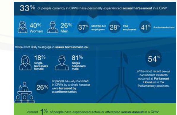
Figure 2. Data on Sexual Violence in the Australian Parliament (Adapted from Australian Human Rights Commission, 2021). [16]

Based on a report from the Sex Discrimination Commission, the Australian Parliament is not a safe place to work for women. An investigation by Kate Jenkins and her team in 2021 revealed that many women share experiences of bullying, sexual harassment, and sexual assault. Data on sexual violence in Parliament is revealed in the figure below: