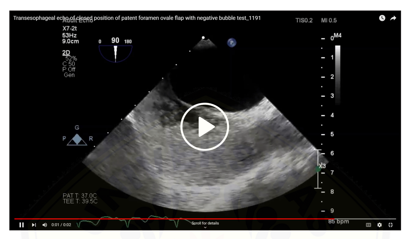
Video 1 Pre-discharge imaging. Transesophageal echocardiogram demonstrates the closed position of patent foramen ovale flap with negative bubble test; see also at https://youtu.be/Q9 kkSG98fw.

oxygen supply without leaving any neurological sequelae. The management, including high-flow oxygen with a nonrebreather mask, increased dose of the inotropic support, and optimal fluid management initially only corrected his blood pressure and hemodynamics while he still presented refractory hypoxemia. Suspicion of cardiac failure and PFO shunt led to emergency echocardiography that revealed significant RV dysfunction and the right-to-left shunt from a flap-like PFO.