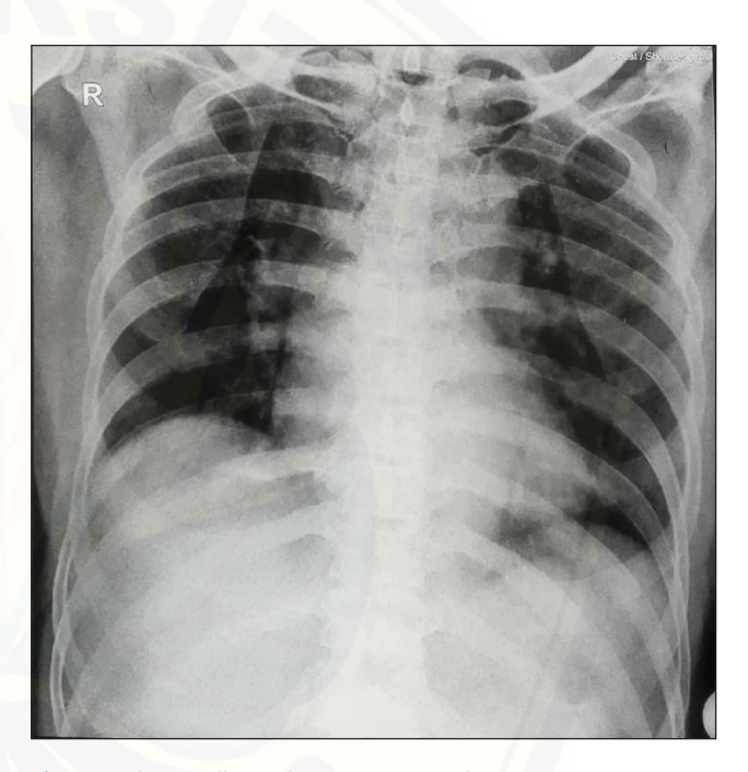
Figure 1 Chest radiograph at emergency department upon patient arrival. The radiograph showed clear lung fields.

The patient's hemodynamics were monitored and stable in the cardiac intensive care unit when he suddenly had a generalized seizure episode that lasted approximately