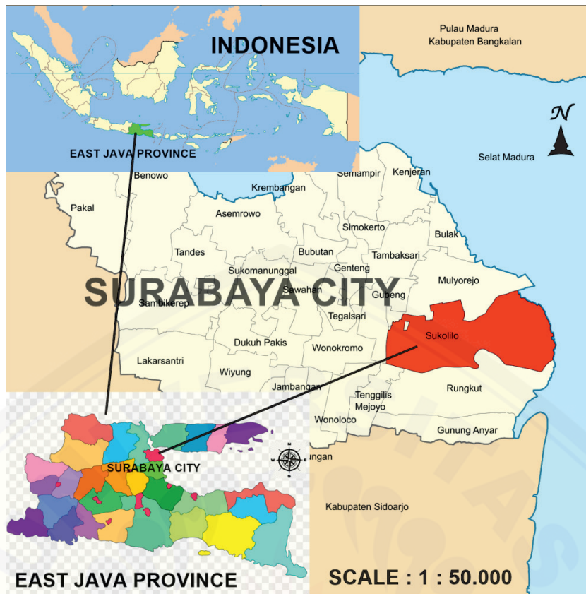
Fig. 1. Geographic location of the research area of Sukolilo District, Surabaya City, East Java Province in Indonesia.

journals, book articles, and other research. Population data was sourced from the Surabaya City Statistics Agency (BPS). Data on waste generation, TPS, and waste transportation equipment were obtained from the Surabaya City Environmental Agency (DLH).