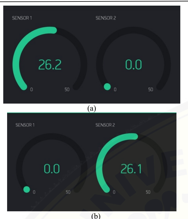
Figure 3. Water Gauge Display at Blynk a) Pipeline 1, b) Pipeline 2