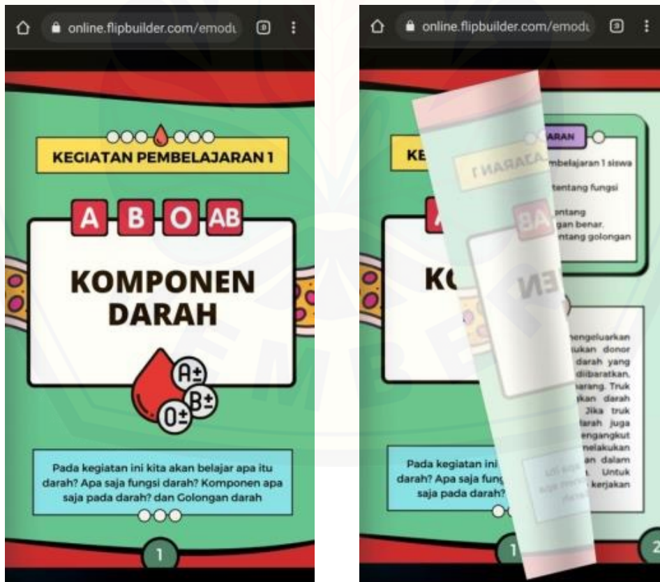
Figure 3. The appearance of the e-module when accessed on a smartphone