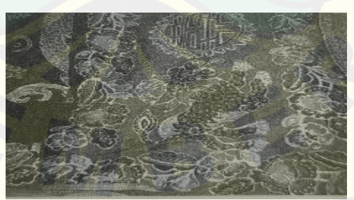
(Pathway to English, Chapter 6, Page 117)

The example above portrays a batik picture that is found in the written announcement text material located in Chapter 6 on page 117. Batik belongs to DIGITAL REPOSITORY UNIVERSITAS JEMBER