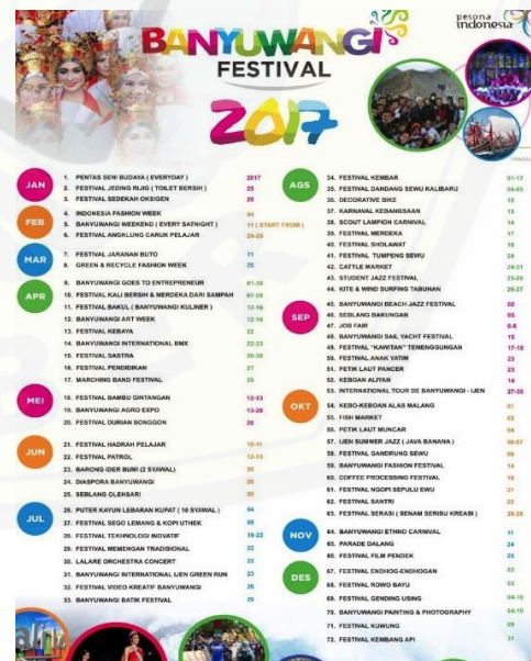
Figure 3: Calendar Banyuwangi Festival 2017.

Innovations also occur with the emergence of new recipes such as rujak soto , sega cawuk , and sambal tempong . The development of rituals, traditional arts, and culinary in Banyuwangi shows signs of mutual support and interdependence. However, all of them boils down to the implementation of the festival which in 2019 reached 99 (Ninety-Nine) festivals.