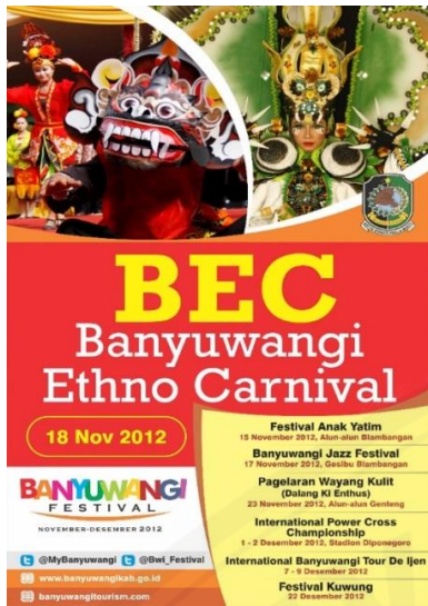
Figure 1: Barong Kemiren became a BEC theme in 2012 (Left) and Using Bride became a BEC theme in 2015 (Right) (Taken from the Banyuwangi Culture and Tourism Office website).

In the digital age, barong plays and rituals "Ider Bumi" which take place every time have been published online that can be accessed by the global community. Banyuwangi, which since 2011 developed traditional art-based fashion, raised themes of art and rituals that lived in the community. Barong Kemiren which is rooted in rituals and has a play that lives as local (oral) literature was appointed as a BEC theme in 2012 that can be accessed by the international community. The Using bridal tradition is part of the Banyuwangi tradition until now is still being lived by the Using community and was adopted as the BEC theme in 2015. Using the Bride who was appointed as a festival theme (BEC) shows that fashion as a form of modern art expression has the potential to package tradition into global stage.