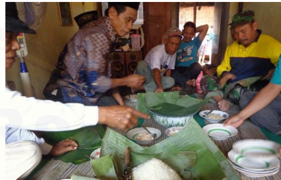
Figure 2: After the Nglungsuri ceremony was attended by the community and the Seblang ritual organizing committee.

Banyuwangi culinary specialties, such as pecel pitik , ointment, and other dishes. The development of tourism makes dishes that were originally as part of salvation, such as pecel pitik , and then develop into culinary offerings that are sold to tourists. The culinary offerings educate the public and tourists about a variety of local-based culinary flavours.