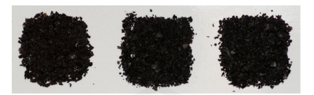
Figure 1. Dried tea of jambolan fruit peel

6th International Conference on Sustainable Agriculture, Food and EnergyIOP PublishingIOP Conf. Series: Earth and Environmental Science 347 (2019) 012085doi:10.1088/1755-1315/347/1/012085