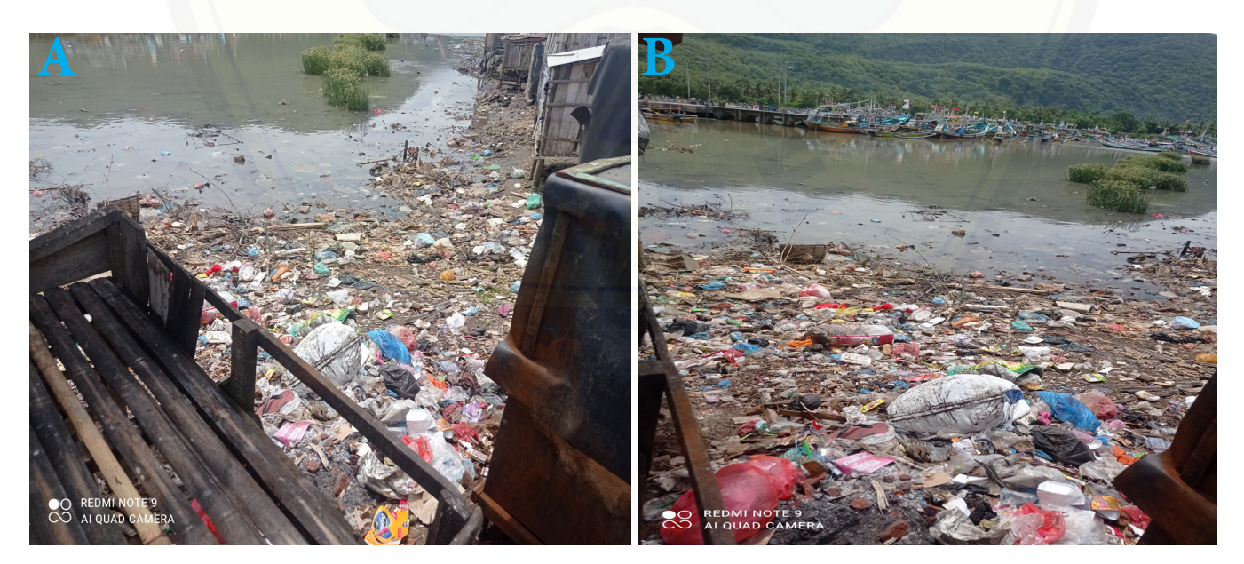
Figure 2. (a) Garbage Pollution on Puger Beach; (b) Garbage Pollution on Payangan Beach