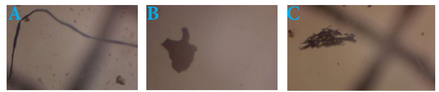
Figure 3. Types of microplastics in marine fish samples, a) fiber; b) fragments; c) filaments