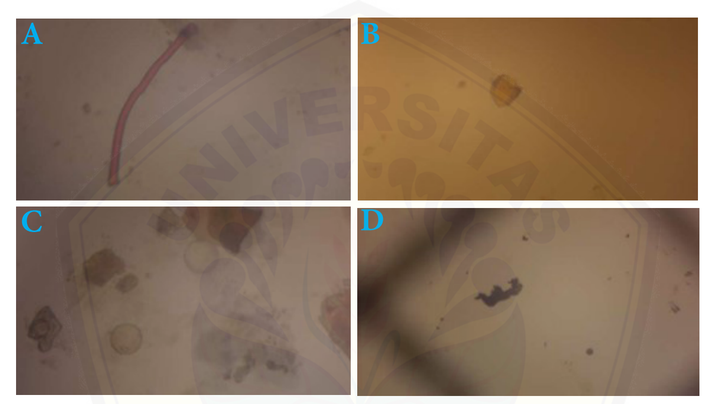
Figure 4. Types of microplastics in shells samples, a) fiber; b) fragments; c) granule; d) filaments