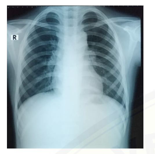
Figure 2. Treatment result. Chest X-ray posteroanterior view after anti-tuberculosis drug treatment for

in patients with miliary tuberculosis.<sup>6</sup> Spontaneous pneumothorax can be classified as primary or secondary. Primary spontaneous pneumothorax occurs in healthy people in the absence of previous lung disease, whereas secondary spontaneous pneumothorax is a complication of lung disease. Secondary spontaneous pneumothorax in this case can worsen lung function, whereas miliary tuberculosis can complicate the management of pneumothorax.<sup>7</sup> The symptoms of spontaneous pneumothorax are tightness and chest pain on the side of the pneumothorax. Physical examination shows cyanosis, hypotension, hyperresonant percussion, and decreased breath sounds and vocal fremitus. These symptoms were present in our patient. In patients with miliary tuberculosis, pneumothorax can be missed due to radiologic findings resembling miliary tuberculosis without pneumothorax. The initial management of pneumothorax in miliary tuberculosis is tube thoracostomy and immediate administration of antituberculous drugs.<sup>4</sup> This disease has a high mortality rate, so early diagnosis and immediate treatment with antituberculous drugs can save lives. The response to antituberculous drugs is good.<sup>3,8</sup>