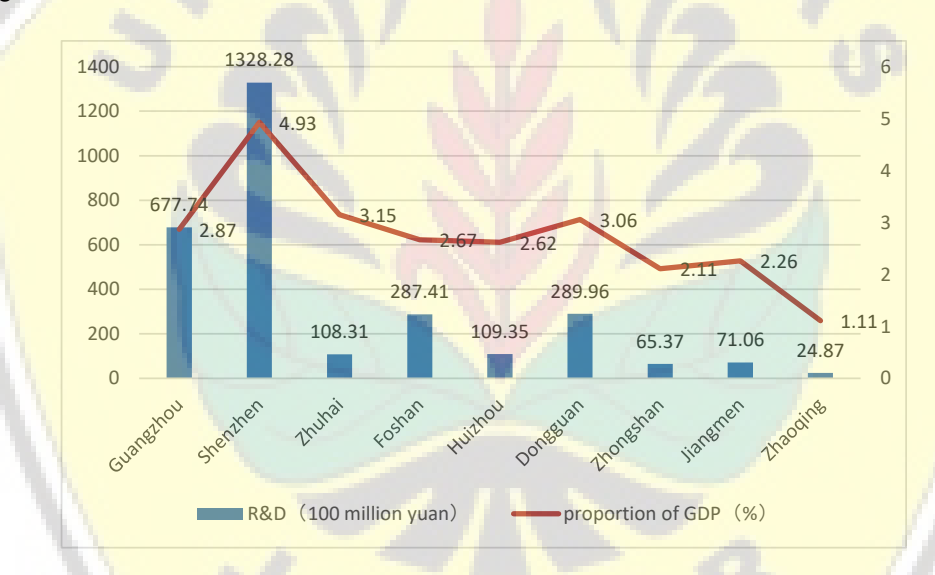
Figure 1: R&d investment and its proportion of GDP of the nine Pearl River Delta cities in Greater Bay Area in 2019

In 2019, the nine PRD cities invested 296.235 billion Yuan in R&D, accounting for 2.5% of GDP on average. Guangdong, Shenzhen, Zhuhai, Foshan, Huizhou and Dongguan topped the national level of 2.19%. Among them, Shenzhen's R&D investment reached 132.828 billion Yuan, accounting for 4.93% of GDP (see Figure 1), far exceeding the national level.