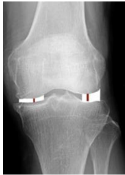
Figure 2. Minimum Joint Space Width / mJSW (red line)