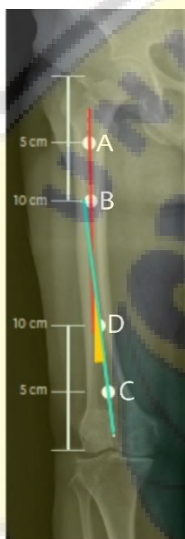
Figure 1. Femoral Bowing Angle/FBA (yellow shaded area)

squatting posture by widening the distance between the knees and making contact between the thighs and calves. This study took the femoral bowing angle (FBA) as a variable because of its association with knee osteoarthritis, namely increasing the load on the mechanical axis. The femoral bowing angle (FBA) is an acute angle formed by the intersection of 2 lines. The first line (red line) extends from the center of the femur below the level of the lesser trochanter (point A) past a point 5 cm distal to point A (point B). The second line (blue line) extends from the center of the distal femoral condyle through the center of the femur in a 5 cm proximal direction (point C) and a point located 5 cm proximal to point C (point D) (Figure 1).