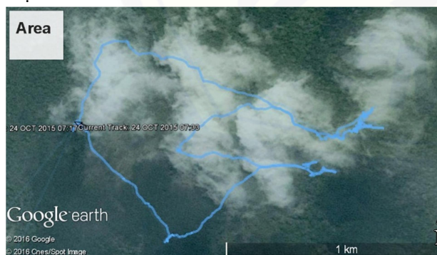
Figure 1. Sampling Location

A total of 24 herbarium specimens of 10 species of had been collected from the study site. The specimens were identified morphologically and compared to several literatures [1], [10]–[14] and specimens collection at Herbarium Jemberiense.