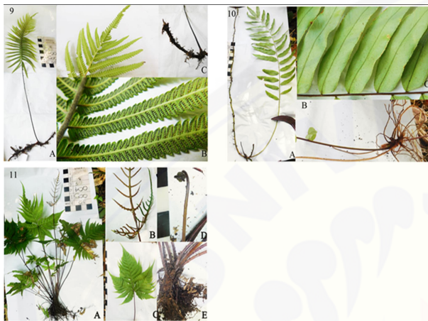
Figure 4 Photo specimen: 1) Sphaerostephanos invisus ; 2) Stenochlaena palustris ; 3) Tectaria aurita