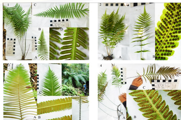
Figure 2 Photo specimen: 1) Amauropelta bergiana ; 2) Christella dentate ; 3) Cyathea bipinnatifida ; 4) Cyclosorus aridus