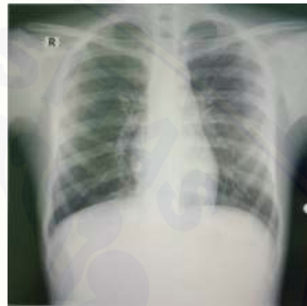
Figure 3. After 6 months of anti-tuberculosis treatment, the heart appeared normal, cardio thorax ratio was 40%.