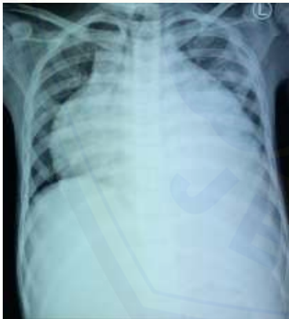
Figure 1. In the first admission, enlarged heart was seen, cardio thorax ratio was 84%.