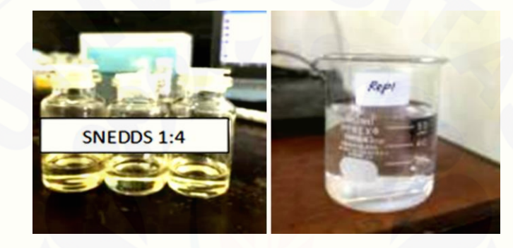
Table I. The mixture of bitter melon seed oil and Smix

Figure 1. Bitter melon seed oil SNEDDS (A) Before dilution; (B) After dilution.