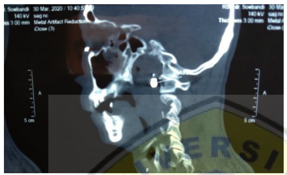
Figure 2. CT scan of cervical region