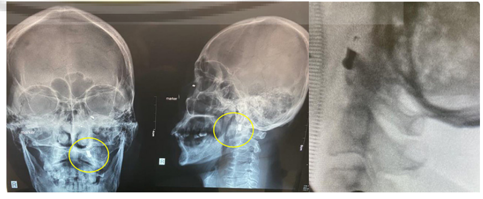
Figure 1. Anterior-posterior and lateral cervical photographs. Corpus allienum found in the upper cervical region (yellow circle)

fluid fistula. The patient showed full of consciousness and intact cranial nerve function during neurological examination, but there were lower paraparesis. After a thorough and stable evaluation, the patient was given prophylaxis as an initial treatment in the ER with ceftazidime and tectagram to prevent probably infection. Then the patient underwent a head and neck CT scan in the ER. Based on CT scan evaluation, there was a corpus alienum with a metal density in anterior of corpus vertebrae as high as C1-C2 without abnormalities in spinal cord (Figure 2).