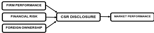
Figure 1: Research framework

Based on the literature review, the framework of this study is as following in figure 1.