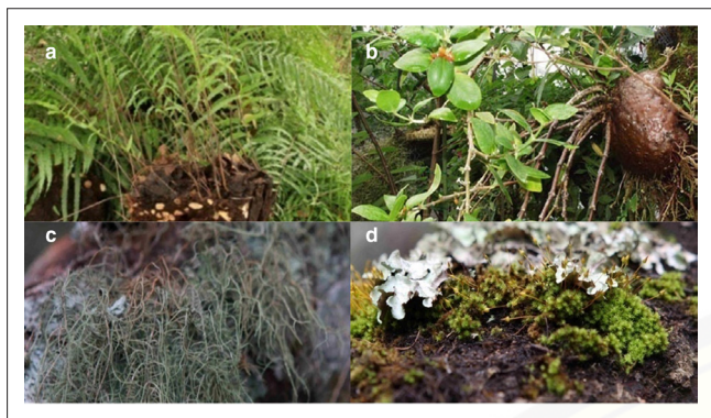
Figure 1. Indonesian epiphytic medicinal plants. (a) Drynaria rigidula L, b) Hynophyllum formicarum Jack, c) Usnea misaminensis (Vain) Motyka and d) Calymperes schmidtii Broth.)

data analyzing these medicinal epiphytic plant, therefore, lead to this current investigation focusing on the chemical and bioactivity investigations of the extracts and fractions of these epiphytes. Specifically, we tested a range of biological activities; as examples, against Plasmodium falciparum given its prevalence in the region as well as the possibility of this microorganism being responsible for some of the symptoms treated in traditional medicine in the region, and against Mycobacterium tuberculosis as a surrogate for antimicrobial activity as well as being a microbe in which new treatments are still being investigated. We also tested against herpes simplex virus type 1, cancer cell lines, and cytotoxicity testing.