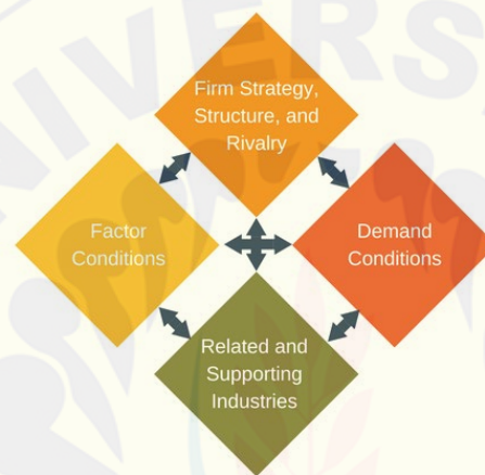
Figure 2.2 Diamond Framework (Porter et al., 2002)

conducive administrative environment, and the availability of natural resources; (2) Context for firm strategy of the University of Indonesia and rivalry: rules and regulations governing competition, such as transparency, anti-corruption, copyright protection, and intellectual rights; (3) Local demand conditions: the quantity and quality of local market demand that is affected by, namely, product quality and safety standards, consumer rights; (4) Related and supporting industries: the existence of industries that support company operations (Porter et al., 2002, 2006). The company's CSR activities can be associated with each of these categories so that the CSR activities are expected to be able to influence the competitive context faced by the company.