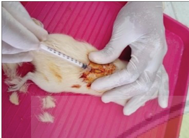
Figure 1: Scaffold application in subcutaneous rats