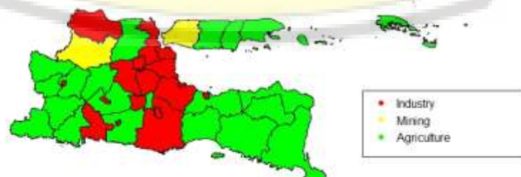
Figure 1: Map of dominant economic activity of cities/regencies in East Java (based on each city/regency's GDP by Sector 2015).

East Java, is one of Indonesia's provinces which performs a steady and strong economic growth. In the fourth quartal of 2017, its economic growth is above the national economic growth (BI, 2017). The economic structure has been dominated by agriculture (forestry and fishery), manufacturing and wholesale – retail trade (BPS, 2017). The province consists of 38 cities/regencies. The interaction between those cities/regencies depends on their geographical location and condition. Nearby cities/regencies, due to their similar geographical conditions, have similar economic activities (see Figure 1). The western part of the province is mountain area with mining potential, the fertile central and southern areas are dedicated to agriculture, whereas the majority of industrial activities are located in the low region in the north. The growth invites some consequences on environmental quality. In 2016, the index of East Java's environmental quality is 58.98 (100 for perfect quality), which is below the national quality index of 65.73 (KLH, 2016).