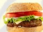
Burger Tempe

One of them is life-based learning with local wisdom for innovative biotech studies. Biotechnology fulfilled an integral part of human civilization, which has an essential position in scientific research [25]. Therefore, there is no reason for the teachers to argue that the obstacles of biotechnology learning are the limitation of materials and resources. The teacher training program should be more innovative and avoid discussing biotechnology topic [26].