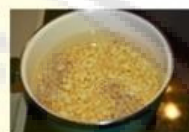
Soaking soybeans