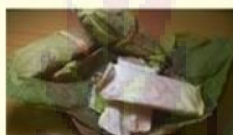
Tempeh wrapped in teak leaves