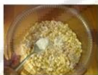
Giving yeast to soybean seeds