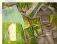
Tempeh wrapped in banana leaves