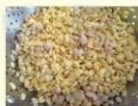
Drain the soybeans