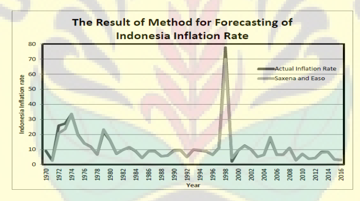
Figure 1. The result of method for forecasting of Indonesia inflation rate

We implemented Saxena-Easo fuzzy time series using MATLAB software. Table 4 summarizes the result of Saxena Easo FTS method for Indonesia inflation rate in 1970 to 2016, where the universe of discourse is divided into 7 intervals and each intervals is divided based on frequency of each intervals with equal length until we get 46 of fuzzy set which is denoted ( X_1, X_2, ..., X_{46} ). Every mid point of fuzzy set is used to compute predicted percentage. The predicted percentage change and actual data for t-1 are used to forecast Indonesia inflation rate for t period. The result shows between actual data and forecast data aren't too different. We can see in 1971, between actual data and forecast data have small square error (SE) about 0.0008. In the following, we compute the accuracy of this method with root mean square error (RMSE). The RMSE of the forecasting of this method is small enough about 1.5289. Figure 1 shows the black line for actual data and the grey line for forecast data with Saxena Easo fuzzy time series. We can see from this graph that the grey line is close enough to the black line, means that result of Saxena Easo fuzzy time series is quite accurate if it's compared with actual data.