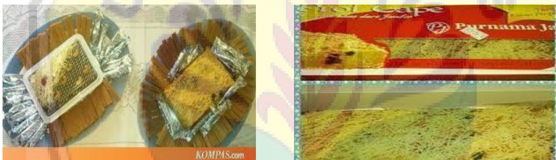
Prol Tape UD. Purnama Jati Packaging