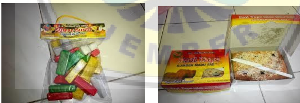
UD Elza dan UD Multirasa Food Packaging

The results of the study revealed that the operation of social capital in the form of trust, networking and organization cannot be separated from the spirit to advance its business so that the assessment that women entrepreneurs cannot develop becomes indisputable. In addition to the spirit to