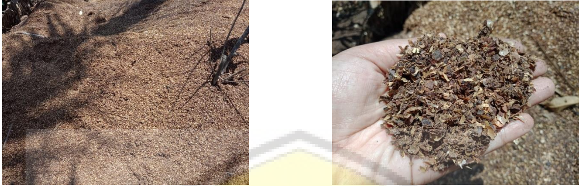
Figure 2. Cascara husk that was not ready to be used as fertilizer.

Respondents piled cascara on a land to be stockpiled for some time until cascara was ready to be used as fertilizer which can be seen on Figure 3.