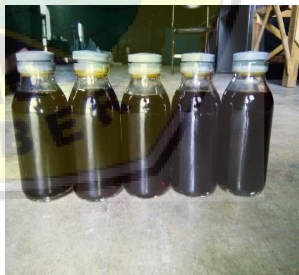
Fig. 5. Liquid Smoke

When stems char made, the smoke was burnt to the pipes and condensed. Therefore, the gas phase from smoke changed into a liquid phase and became liquid smoke. So, from one reactor, the author got two products at once, there was biochar as raw material for bio briquettes and tobacco liquid smoke. The process of making a new product is channeled and made into a unique advantage product. In other words, the making of briquettes and liquid smoke is not only reduced by the solid waste in tobacco plantations but also minimizing water pollution in the environment. The Visualization of tobacco liquid smoke is presented in Figure 5.