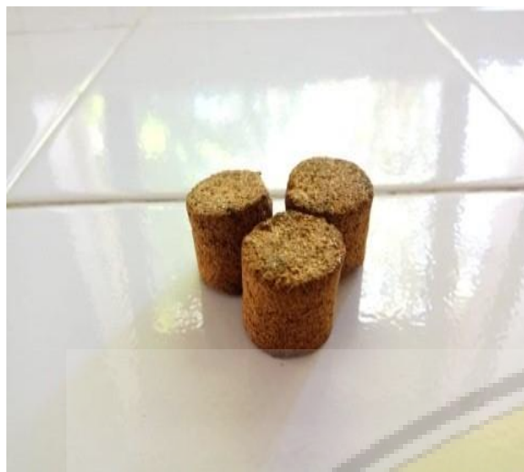
Fig. 4. Biopellets with diameter 4 cm and 6 cm height

The pellets samples tested on five times repetition and calculate the average value (mean). The mean of proximate analysis of bio pellets consist of water content was 3.9%, the volatile matter was 87.75%, ash content was 5.75%, fixed carbon was 2.77%. The mean of ultimate analysis was bulk density was 0.50 gr/cc, the calorific value was 4,793.78 cal/gr, bio pellet consumption speed was 0.24 kg/hour, and weight of ash was 0.232 kg.