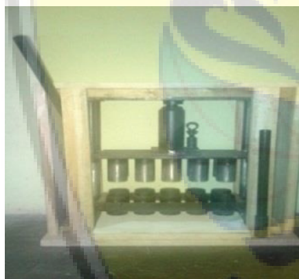
Fig. 2. Semi Manual Press with 10 cylinders form holes