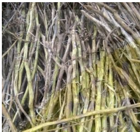
Fig. 1. Tobacco Stems

the fixed carbon, [12] for the total sulphur. The ultimate analysis of bio briquettes is accorded to [13] for the calorific value. The proximate analysis of bio pellets regarding [14] for the ash content, [15] for the fixed carbon, [16] for the moisture content, and [17] for the volatile matter. The ultimate analysis for bio pellets are [18] for the calorific value and [19] for the bulk density. Both describe and analyze the application of tobacco waste products to raise agriculture productivity and a positive impact on the environment.