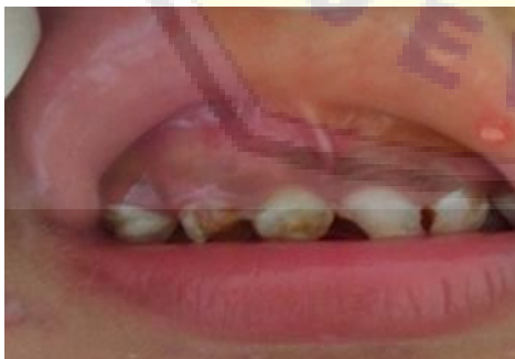
Figure 1. Early photo before Treatment.

Based on extra oral examination, vesicles had been found to spread throughout the patient's body some of which had crusted, and there were ulcers in the upper left labial mucosa less than 2 mm in diameter. The ulcers were marked with clear boundaries, erythema, and white pseudomembrane in the middle of the ulcer, and felt painful.