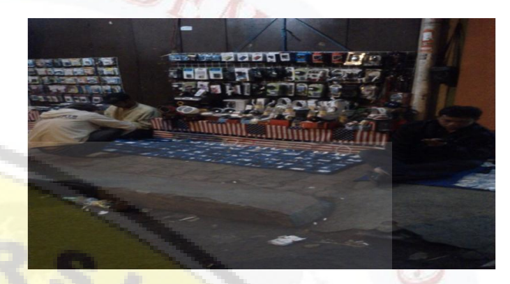
Figure 6 JNM sellers in Gatot Subroto sidewalk

Sellers in a community of JNM does not has the land system. The sellers are free to choose the land and place to sell during the place was not yet occupied by other sellers. The state of land and the selling can be seen in the following figure 6.