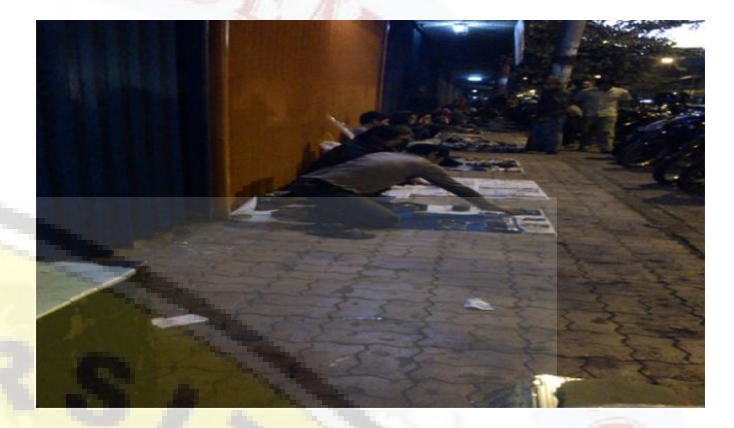
Figure 4. The Seller was preparing their goods

Concerning the operational hours in JNM this indeed does not have official time, but depending on the condition of each seller. also there is who already have opening hours earlier than others, but on the other side there are also sellers who do not have definite schedule .But at 7 pm there were some of sellers open .Can be said to be between 7 pm until at 7.30 pm some sellers are still managing their goods .Following on 4 sellers pictures is preparing goods.