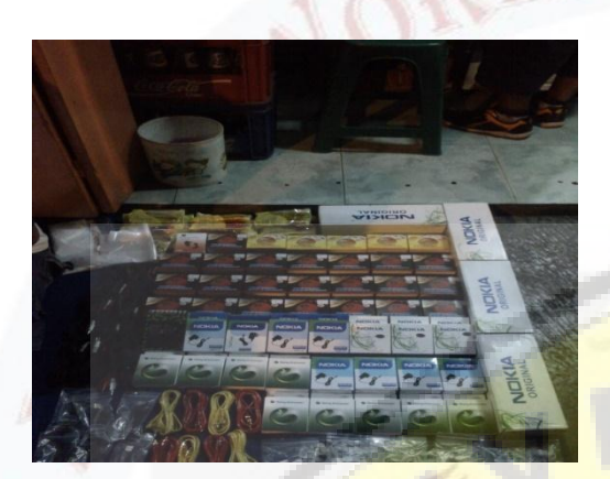
Figure 5 Preorder and guaranteed goods