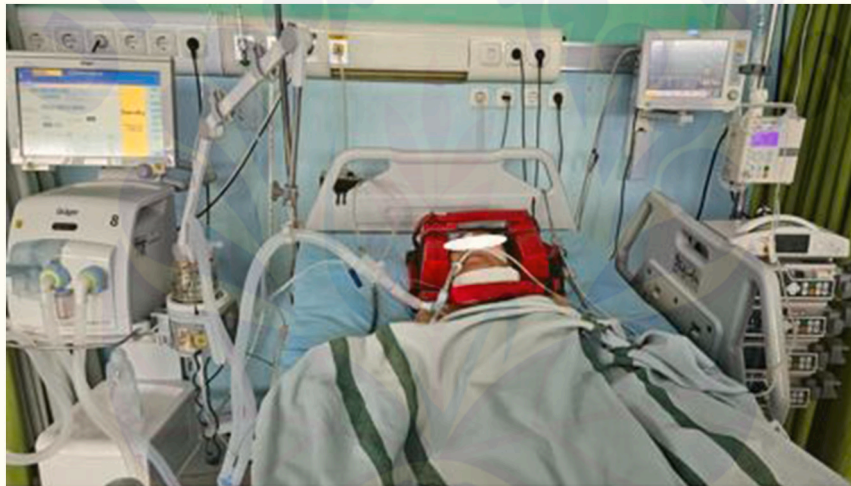
Fig. 3. Post-operative care in the ICU.

problem, result in ischemia, inflammation, apoptosis, and degeneration in formation of glial scar [13]. Excessive inflammatory response causes cytokine and chemokine release, lipid peroxidation, apoptosis, and destroy the normal tissue in spinal cord [14]. The acute phase, which includes damage to blood vessels, electrolytes imbalance, accumulation of neurotransmitters, formation of free radicals, calcium deficiency, lipid peroxidation, inflammation, oedema, and necrotic cell death, starts immediately after SCI [15].