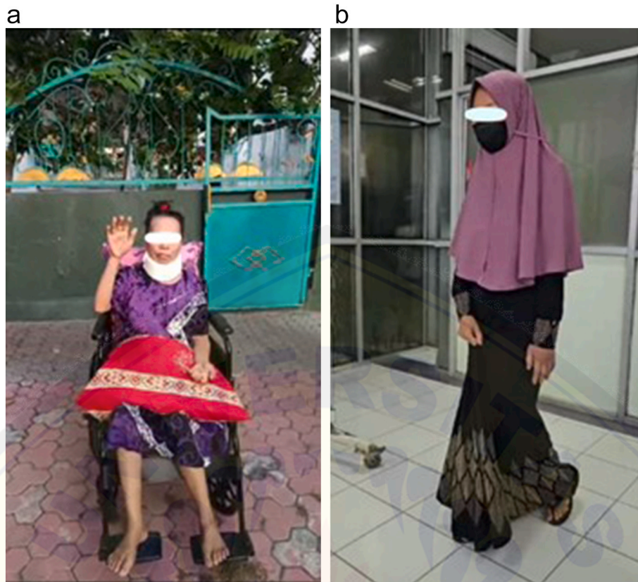
Fig. 4. Post-operative patient development process: A. Seven days after leaving the hospital, B. Three months after leaving the hospital.