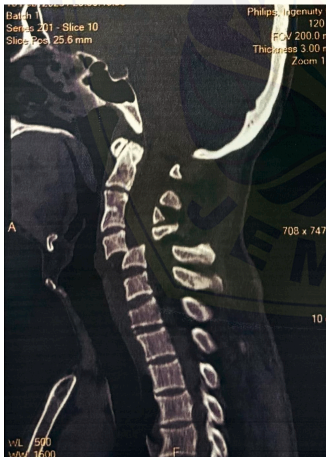
Fig. 1. Lateral plain x-ray of the cervical before surgery, shows dislocation of 5–6 cervical vertebrae.

Three months after surgery, the right- and left-hand motor strengths of the patient were 5 and 5; while right- left leg motor skills of the patient were 5 and 5; normal function of bowel and bladder. Activity daily living (ADL) was evaluated using the Japanese Orthopedic Association (JOA) and Oswestry Disability Index (ODI) score are 16/17 (normal