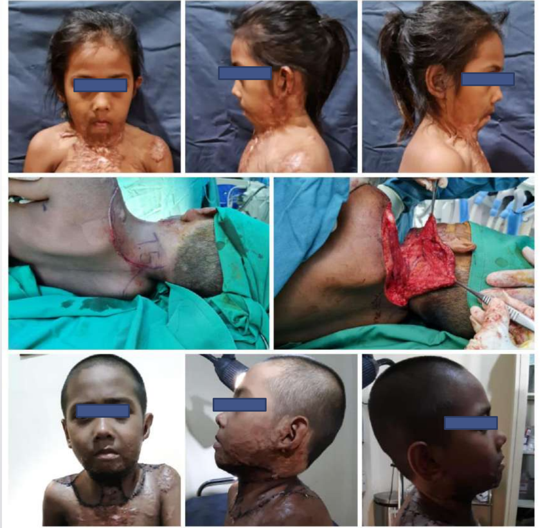
One week after operation

A split-thickness skin graft is applied to the submental defect, donor site, and the anterior chest wall.