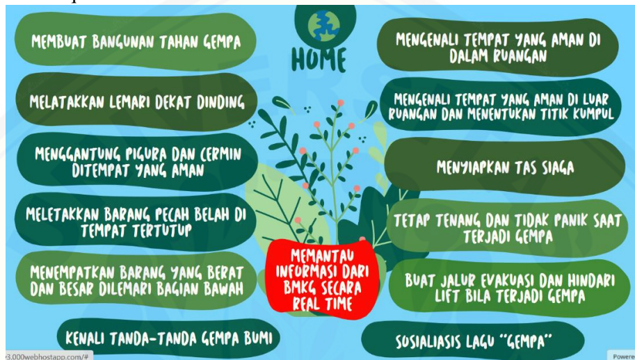
Figure 4. Display of the earthquake disaster mitigation simulation page

Figure 3 shows volcanic eruption disaster mitigation which consists of 14 actions including making lava flow paths, constructing fire and volcanic dust resistant structures, conducting socialization to the community, recognizing quick and precise evacuation routes to the gathering point, preparing a standby bag containing equipment what is urgently needed, monitoring mountain activities, making the village Tangguh a disaster, not within the radius set by the BMKG, coordinating with the three pillars namely the government, DUDI and the community, not being in the area of the lava flow, using a mask/wet cloth and wearing covered clothes and make disaster-prone maps and recognize signs of earthquakes and monitor information from BMKG in real time.