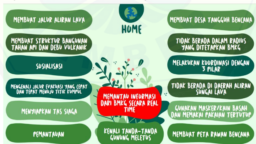
Figure 3. Display of the volcanic eruption disaster mitigation simulation page

The task given in the web-based virtual worksheet is in the form of a simulation of volcanic eruption and earthquake disaster mitigation, in which students can perform appropriate disaster mitigation simulations when disaster comes. The presentation of the disaster mitigation simulation can be seen in the figure 3.