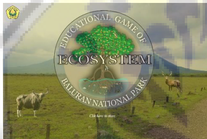
Figure 2. Game Introduction On the opening page, that is the starting page when the media "Educational Game of Baluran National Park Ecosystem" is opened. It will appear the media's logo image and Jember University's logo image. If the text of "click here to start" has been clicked, it is guide player to start playing the game.

The feedback contained in this learning media are diverse, accurate and in accordance with the response given by the media to player input. The feedback contained in this media among others are 1) in the section "To Know Abiotic Factor" where if the players enter the measurement results are still not right there is no reduction in the score, there are sentences to continue to try to answer correctly. Thus, feedback of this type will not make students give up and become discouraged. 2) in the section "To Know Biotic Factor" there is the concept of increasing time if the player answers wrong where, the concept of time in this section is seconds of time progressing. This can increase the enthusiasm of students to compete in order to be able finish the game quickly and do not have to add time when they have answered incorrectly.