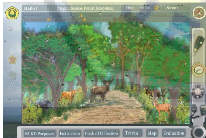
Figure 4. Part of Biotic Factor The special thing in this section, there is star-marked objects, where if the object is found, a brief description and classification will appear regarding the object. The star-marked object may be endemic flora and fauna or unique to the ecosystem.