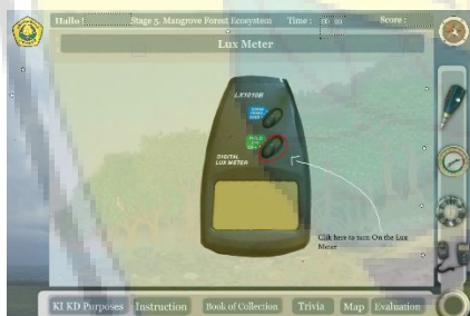
Figure 3. Part of Abiotic Factor In addition, informations about the tools such as functions, parts, and how to read the measurement results of the tools are considered for each stage on the "Instruction" button for helpful instructions.