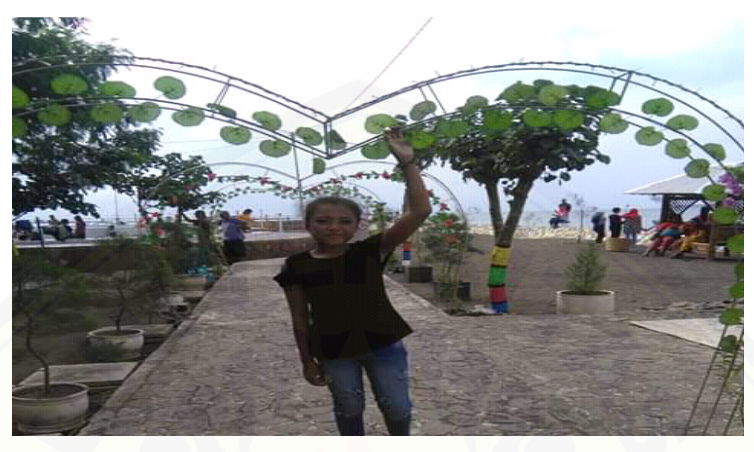
Picture 1. Mixed language Madurese-Indonesia

"Pemandangannya bagus, sayang bâceng èè" (The view is good but smelled animal waste).