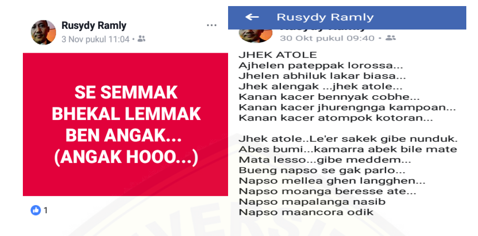
Picture 10. Lyrical and Poetic Pattern

The last criticism model is using lyrical and poetic pattern. This kind of criticism model is quite favored by Madurese people in Situbondo. Most of Situbondo people know poetic practices (papareghân). Criticism by using papareghân and poetic model is criticism model acceptable to all people. Besides linguistically beautiful, this kind of criticism model also becomes entertainment for readers. So it is often when someone writes facebook status by using this model, then it will be responded by other social media users by using the same model like expressing each other poems.