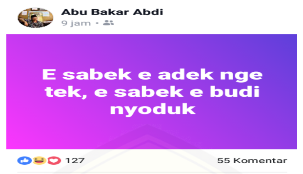
Picture 11. Dimension of Ethnic Group

It needs to explain that a user of the status is a part of Arab ethnic community in Sitibondo. Use of Madurese as criticism language in social media contains meaning that the speaker also identifies as a part of Situbondo people. Self-identification is shown by using language spoken by dominant people in Situbondo.