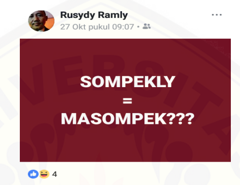
Picture 2. Mixed language Madurese - English