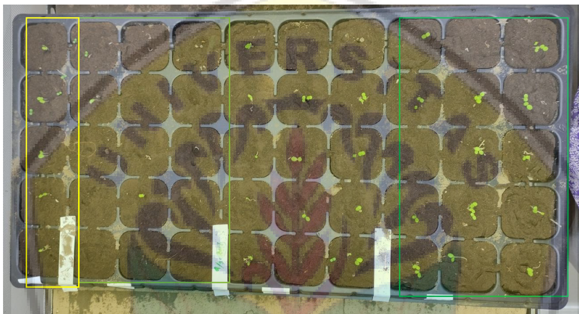
Figure 1. The growth promoter reaction compared to control (Green Box) and Seedling Symptoms (Red box) in Seedling Test compared to control (yellow box)

The plant host species, the microbe type, species, race and mechanism are the most factors to influence the growth of plant. Not all endophytic microbes have mechanism to boost the growth of the host. The growth promoter is just one of symbiotic mechanism among plant host and endophytes. However, the deep screening is the first pathway to the develop the endophytic. Its also the most important path on the development non host endophytic microbes. While, the visible necrotic symptom is the most part on evaluation system during the endophytic sreening.