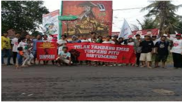
Figure 3. Forms of Public Protest

Since the beginning of the mining concession, which the Banyuwangi Government permitted, there were pros and cons among the Sumberagung community, such as the many questions regarding the validity of the issuance of the Banyuwangi Regent's decree (before 2013), which was judged at that time to be legally flawed because it used the wrong legal basis, which was not accompanied by a decree or a decree. Ministry of Forestry recommendation. In addition, many figures and informants met by the researchers also admitted that they did not receive any prior socialization from the government or companies. When referring to the openness of permits adjusted by the AMDAL, the community must be involved in the decision-making process.