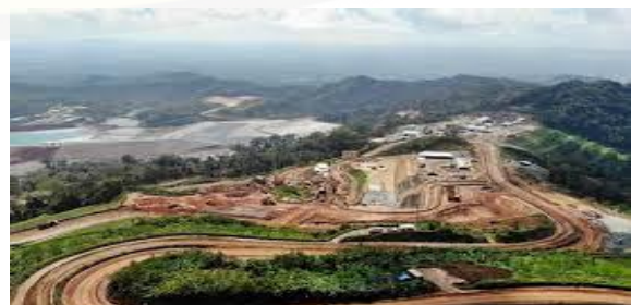
Figure 2. Gold Mining Exploitation Activities

The conflict that occurred was manifested by massive protests against PT. BSI and the Banyuwangi local government, by holding demonstrations (Figure 3). Most of the residents flocked to the entrance of the open-pit mining area to protest. This event was the initial condition where the extracted waste above Tumpangpitu was washed away by the flood and entered the tourism area of Pulau Merah. What residents consider to be quite worrying is the proximity of the mining waste storage pond to the Fish Auction Place (TPI) in Pancer Hamlet, Sumberagung Village, which is only about 6.7 Km away.