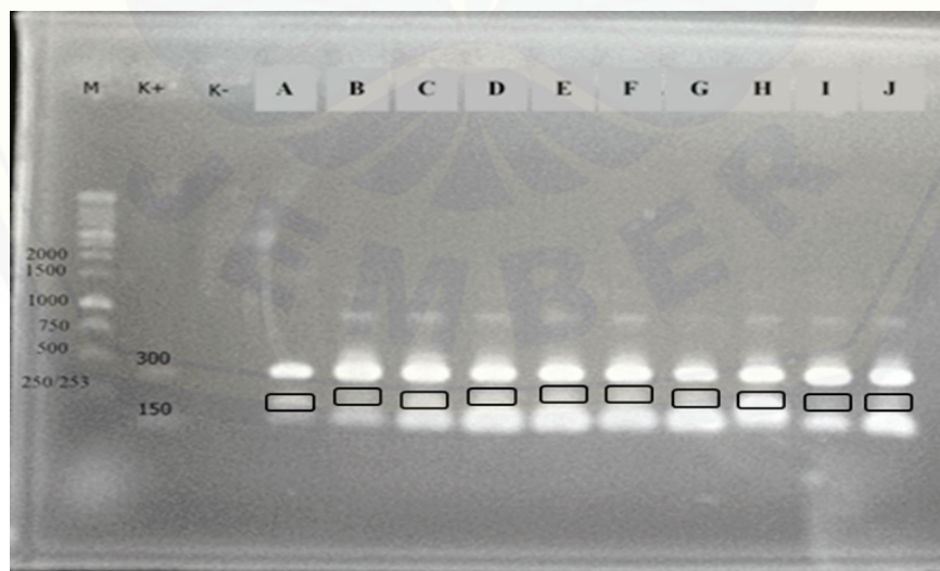
Figure Electrophoresis Results in 1% Agarose Gel

Data analysis using IBM SPSS Statistics 24 for male subjects revealed the r count value (Pearson Correlation) of 0.888 with a 2-tailed significance value of 0.04. Based on the R table, the R-value for n=5 with a significance of 5% was identified as 0.878. Because r counts were higher than the r tables and the significance value was less than 0.05, it was concluded that there was a significant correlation between percent methylation and age