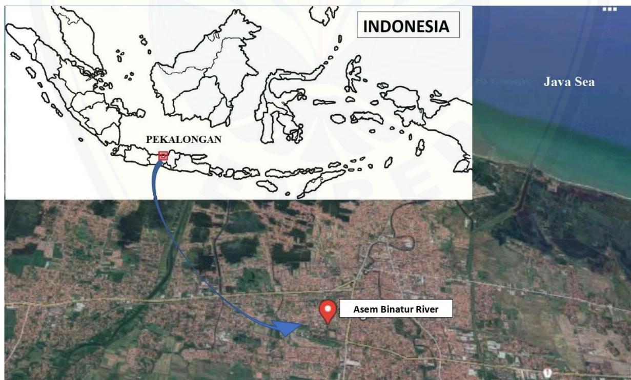
Figure 1. Location of the Asem Binatur River, Pekalongan, Indonesia

Collection of dragonflies was conducted in the morning from 07.00 until 10.00 hours. The observation time was 30 minutes at each station using a long high hand net, wrapping paper or papilot and camera at eight stations. A point count method was used with the distance in between observation points of about 50 m. Each sampling station consisted of three observation points. The species of dragonflies were identified and counted in-situ and counted. The main