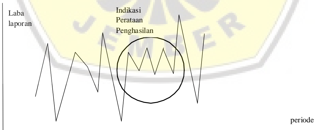
Figure 1 Profile of Earning Report

Companies are classified as smoothing if